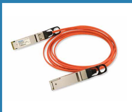
Active Optical Cables