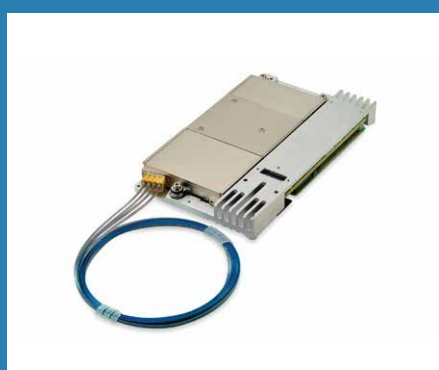
Wavelength Management, ROADMs, WSS and Amplifiers